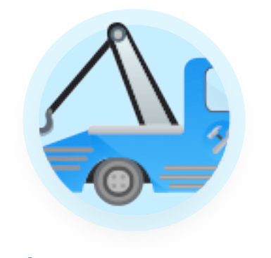
No Accident/Damage Records Found