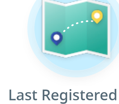
Last Registered In: Ontario (Normal)