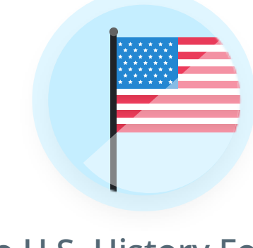
No U.S. History Found