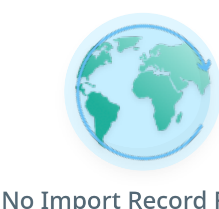
No Import Record Found